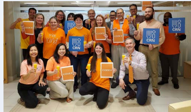
CRN staff help celebrate Codex's 60^{\rm th} anniversary. CRN has been vocal at in-person and virtual Codex meetings and regularly submits comments on behalf of the dietary supplement industry to the Codex Secretariat to give voice to CRN members' perspectives.