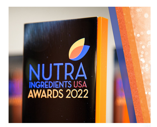
WINNER EDITORS AWARD FOR INDUSTRY INITIATIVE OF THE YEAR