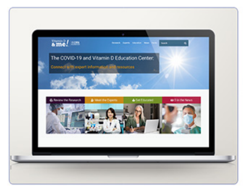
Vitamin D & Me! CRN Foundation

The CRN Foundation's Vitamin D & Me! campaign won the 2022 NutraIngredients-USA Editors Award for Industry Initiative of the Year. CRN associate member Nutrasource was the foundation's partner for scientific content development. As of July 2022, the Vitamin D & Me! website has tracked and summarized more than 100 clinical studies on vitamin D and COVID-19, with 5.8 million unique visitors.